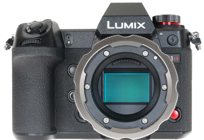
Panasonic S1H with Wooden Camera PL to L-Mount Adapter