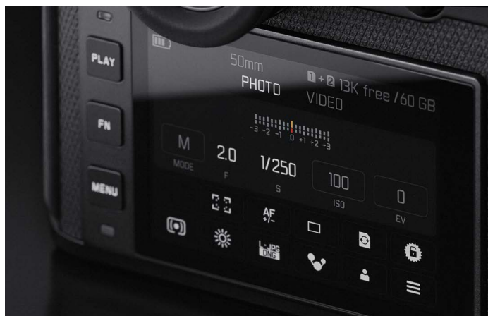
Photo Mode, above, showing 1/250 sec shutter speed, 100 ISO, etc. Video Mode, below: 180° shutter, 400 EI / ASA, timecode, audio levels.

We think the Cine mode may help to integrate the SL2 camera into motion picture productions.