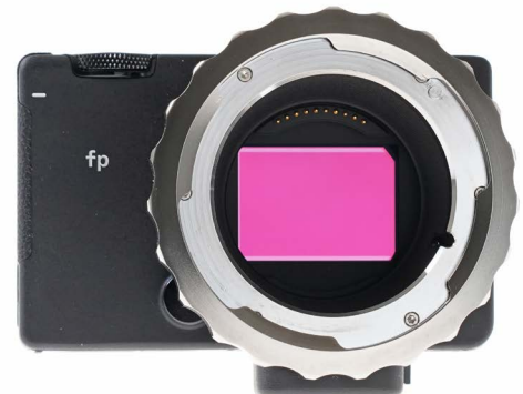
SIGMA fp with SIGMA PL to L-Mount Adapter