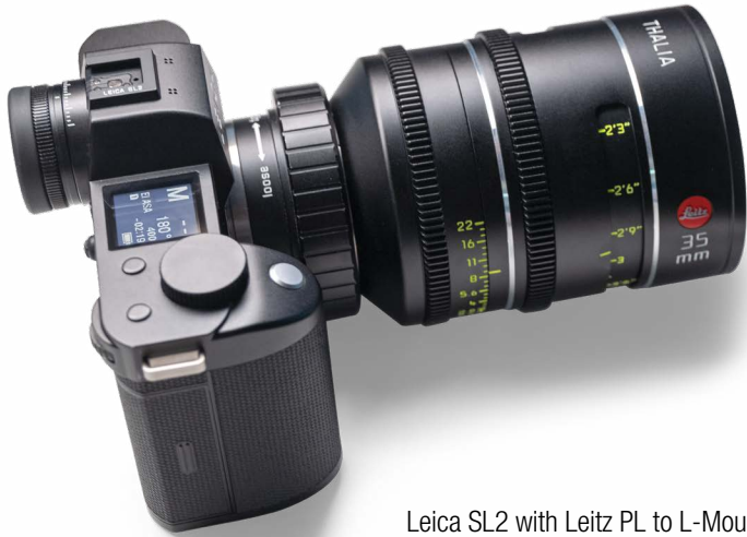
Leica SL2 with Leitz PL to L-Mount adapter and Leitz THALIA Large Format cine lens.