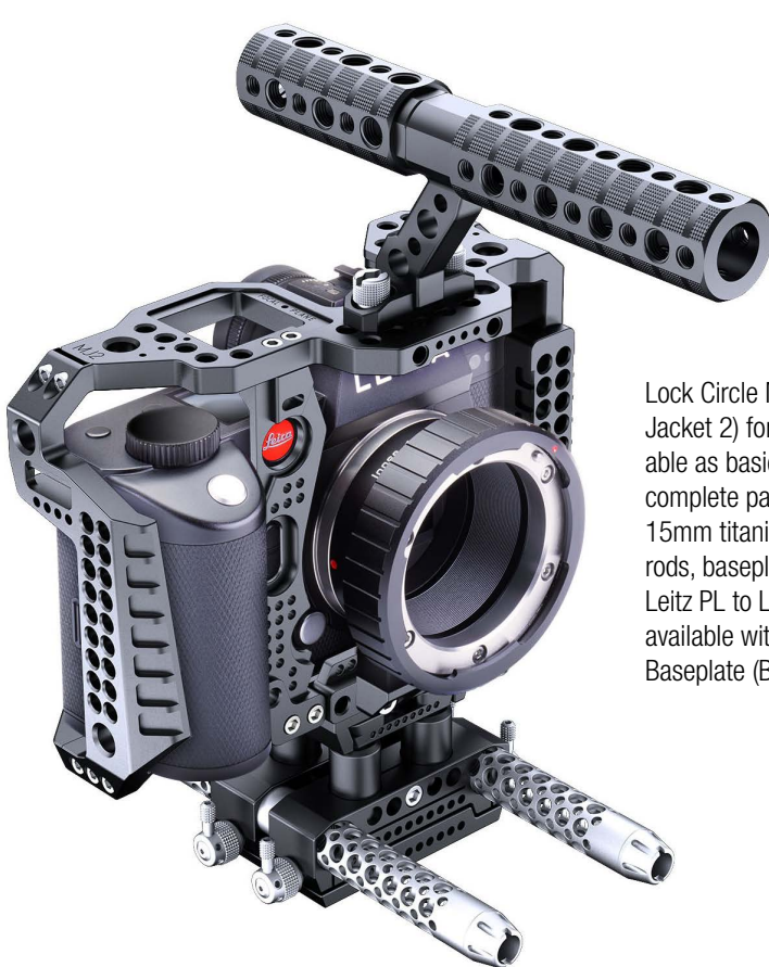
Lock Circle MJ2 (Metal Jacket 2) for SL2. Available as basic cage or complete package with 15mm titanium grade 5 rods, baseplate and original Leitz PL to L-Mount. Also available with ARRI 19mm Baseplate (BP-8) Adapter.