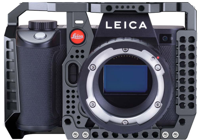
Leica SL-2 with Lock Circle Metal Jacket 2 and Leitz PL to L-Mount Adapter