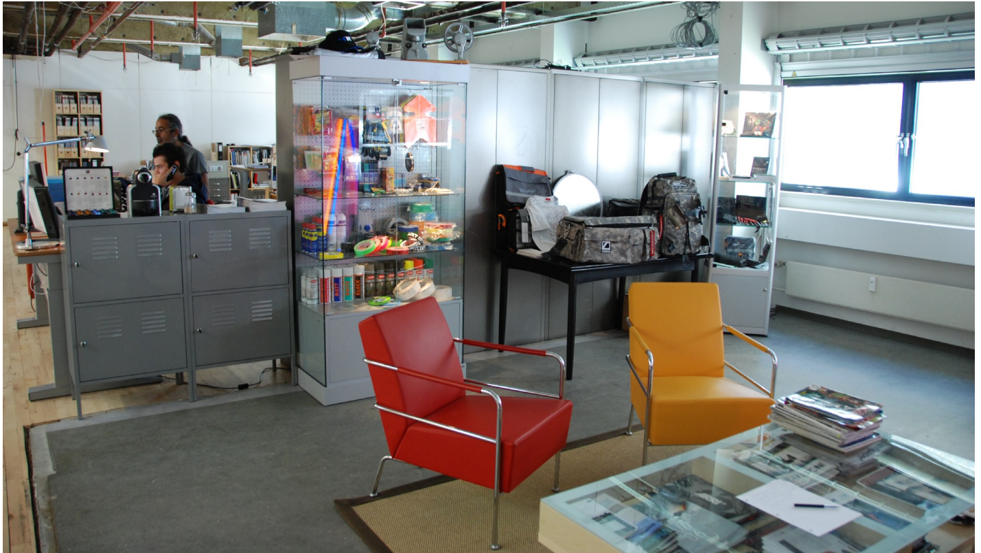
Below: Expendables, library and reception area.