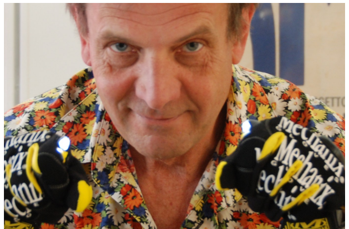
The very cool Blixt expendables department carries these sci-fi looking, but actually very useful, grip gloves with built-in LED flashlights. Sewn into the prehensile fingers are LEDs and batteries. Perfect for night shoots or dark Scandinavian winter days.