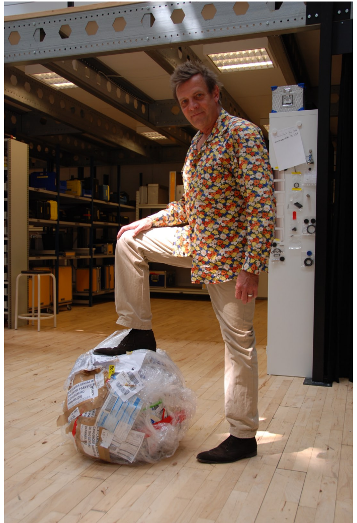
Ball of sticky labels scraped off of cases. Blixt the Great Dictator...er...Decorator?