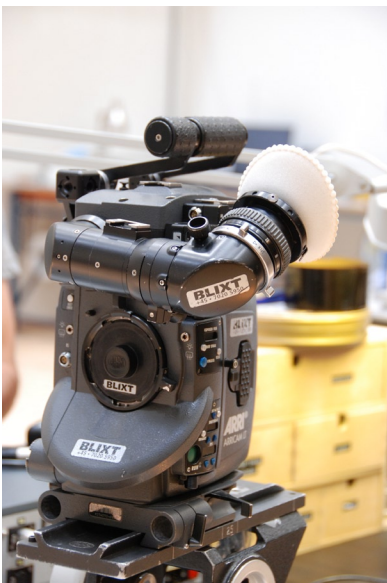
Resa Farsangi prepping an Arricam Lite.