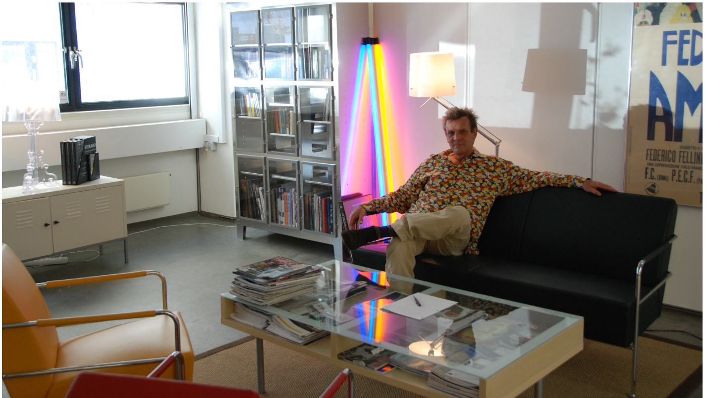
The well-stocked library is larger than most university film studies collections, and includes Vittorio Storaro's trilogy (background, left).