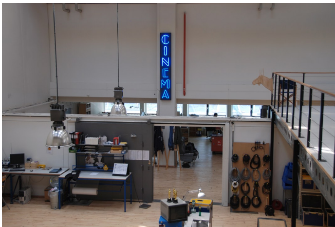
Camera prep area at Blixt.