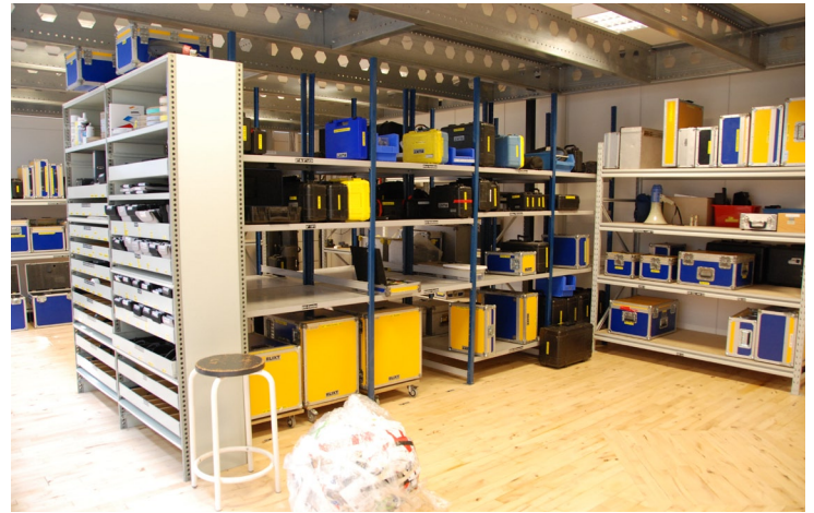
Equipment storage area: Aaton, Arricam, Red, Angenieux, Cooke, Zeiss and much more.