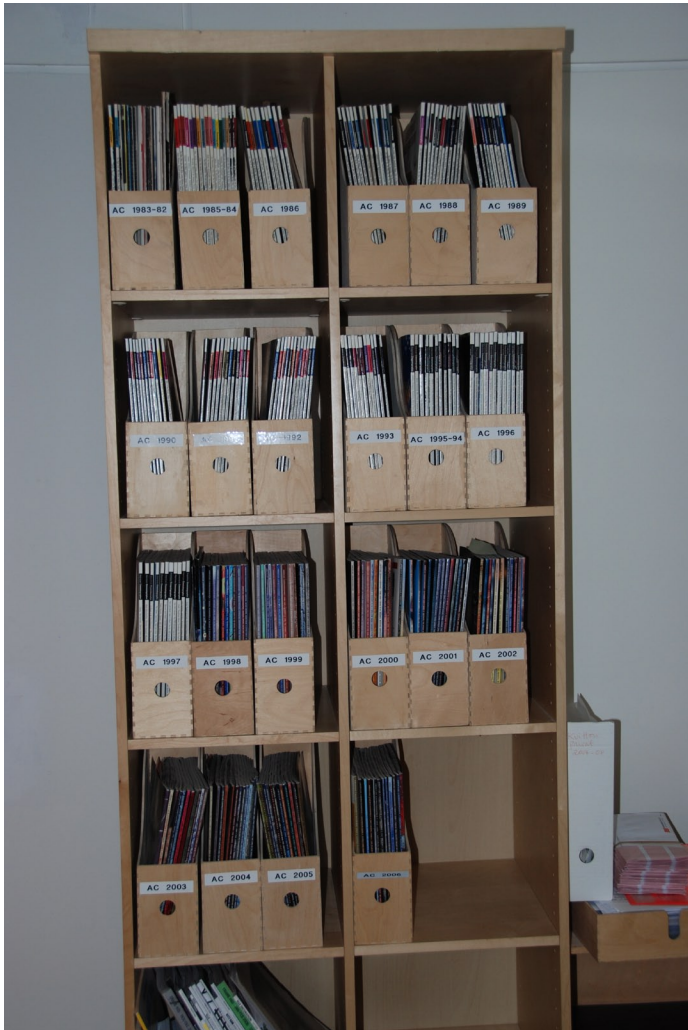
Blixt's library includes the largest collection of "American Cinematographer" in northern Europe.