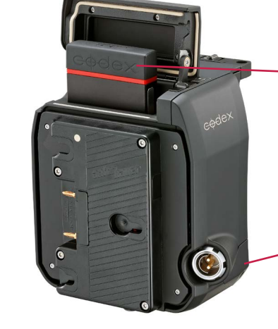
Codex Capture Drive 2.0 (in 1 TB or 2 TB capacity) is the same familiar media used in Alexa and VariCam35.

10-32 VDC external power in 2-pin Fischer connector