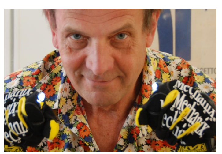
The very cool Blixt expendables department carries these sci-fi looking, but actually very useful, grip gloves with built-in LED flashlights. Sewn into the prehensile fingers are LEDs and batteries. Perfect for night shoots or dark Scandinavian winter days.