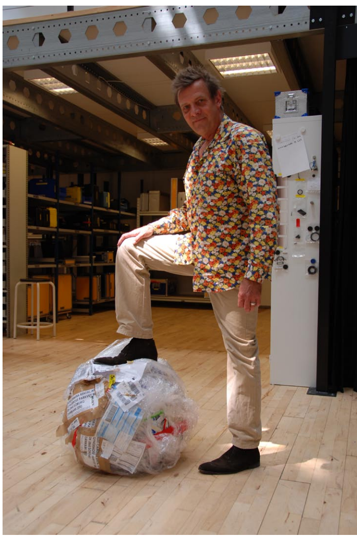
Ball of sticky labels scraped off of cases. Blixt the Great Dictator...er...Decorator?