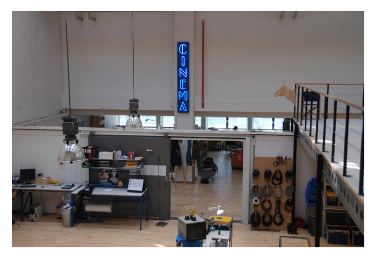
Camera prep area at Blixt.