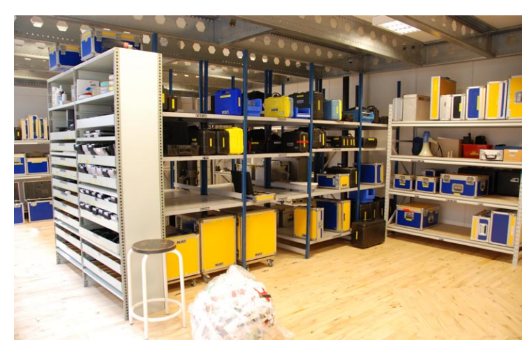
Equipment storage area: Aaton, Arricam, Red, Angenieux, Cooke, Zeiss and much