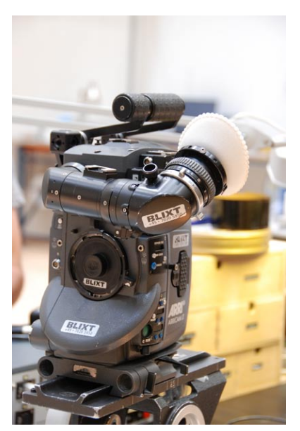
Resa Farsangi prepping an Arricam Lite.